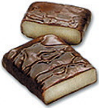
Enrobed mint fondant bar