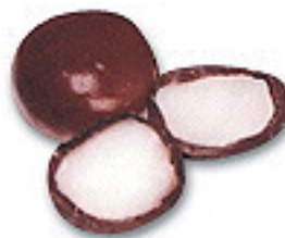
Small piece fondant chocolate panned