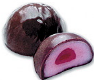
Enrobed centre fill crème