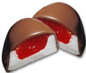
Filled fondant Cup

Mouth watering combinations of colour, flavours and shapes